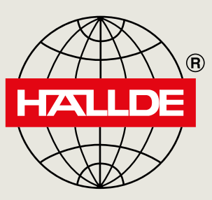
Food Preparation Machines Made in Sweden